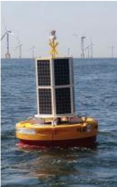
Figure 2 Sediment monitor buoys

These buoys may be removed between November and February