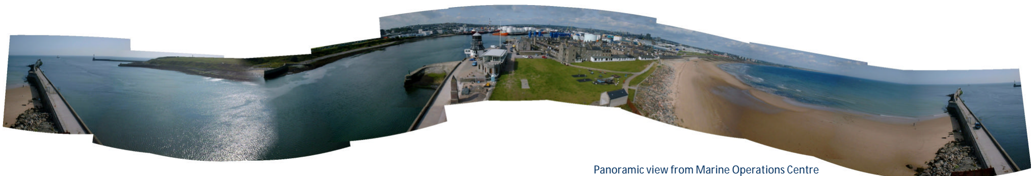
Panoramic view from Marine Operations Centre